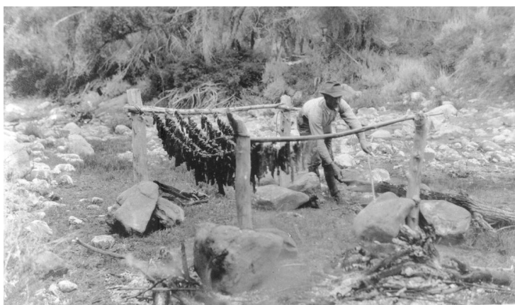
Harb Morris, who favored the line-drying method, tends to venison jerky at camp in the 1930s. Note fires built on two sides, probably to repel flies and yellow jacket wasps rather than smoke the meat.