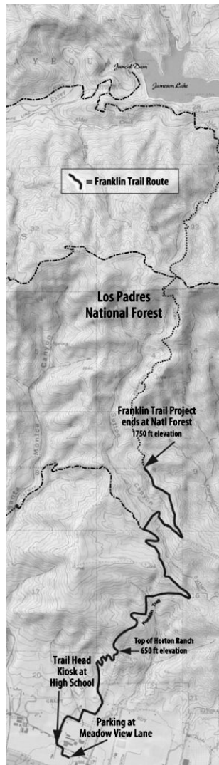
Map of the Franklin Trail.