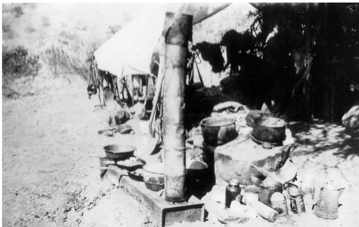
"Ice Can" stove and kitchen set-up at La Carpo Potreros camp.