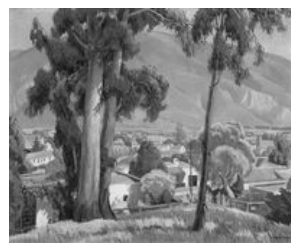
Plein air painting by C. Botke at the Santa Paula Art Museum.

Back onboard, our next stop, Loose Caboose Garden