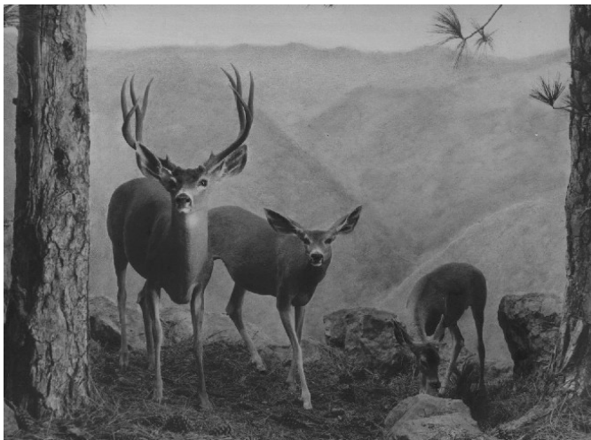
The deer diorama exhibit in the mammal hall of the Santa Barbara Museum of Natural History shortly after its original installation.