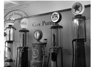
Vintage gas pumps on display at the California Oil Museum.

downtown Fillmore, we will depart the station to travel through the beautiful orchards and agricultural fields of the Santa Clara Valley. Once underway, we will enjoy a full 3-course "Heritage Valley" lunch during the trip to downtown Santa Paula. Our special luncheon consists of a garden salad, orange glazed chicken breast, rice pilaf, vegetable, roll & butter and coffee, tea or soda. Docents will meet the train at the historic Southern Pacific Santa Paula depot and guide our group on a walking tour of a few of the downtown murals on our way to the California Oil Museum and then the Santa Paula Art Museum, or to the new California Farm Museum, situated right next to the tracks in Railroad Plaza.