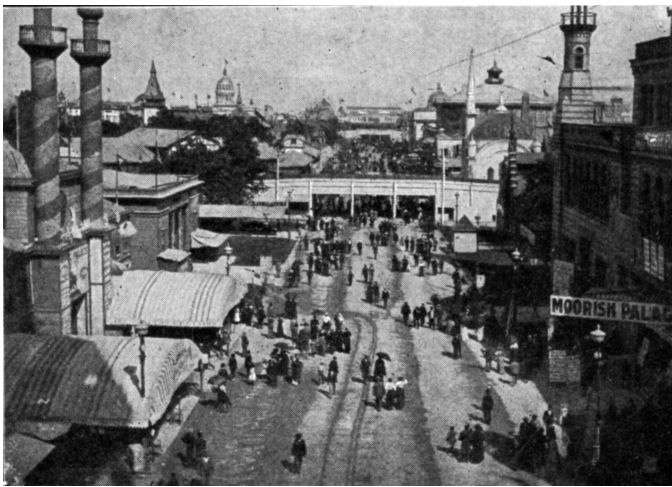
The Chicago World's Fair Midway Plaisance, which was lined with many unusual attractions and amusements, carnival rides, and cafes and food courts.

Eadweard Muybridge gave a series of lectures on the Science of Animal Locomotion in the Zoopraxographical Hall, built specially for that purpose on Midway Plaisance. He used his zoopraxiscope to show his moving pictures to a paying public, making the Hall the very first commercial movie theater.