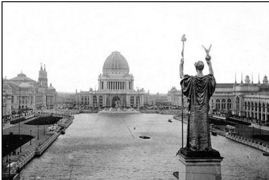
The one-third scale replica of statue "Republic" rises above the Court of Honor of the Great White City at the World's Columbian Exposition of 1893.

Louis Sullivan's polychrome proto-Modern Transportation Building was an