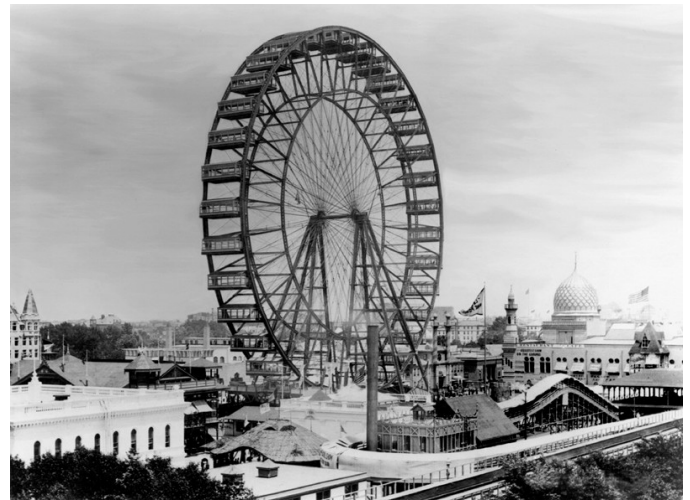
The first Ferris Wheel operated at the Chicago World's Fair. The wheel was 264 feet high and had 36 cars, each of which could accommodate 60 people.

The Midway Pleasance [sic] was a street with 2 or 3 buildings from all of the foreign countries. They sold all manner of trinkets and there were some glass makers from Italy. The Ferris wheel was quite a curiosity, but I didn't take a ride on it.