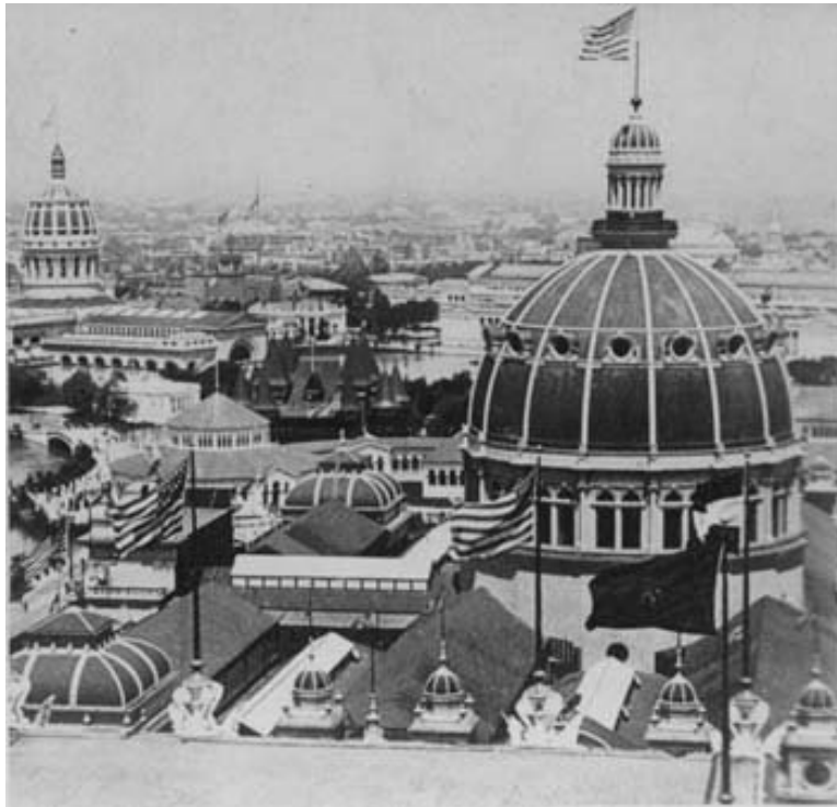
Another view of some of the 200 buildings erected for the Chicago World's Fair of 1893.

The World's Columbian Exposition was the first world's fair with an area for amusements that was strictly separated from the exhibition halls. This area, developed by a young music promoter Sol Bloom, concentrated on Midway Plaisance, included carnival