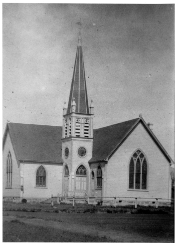
Carpinteria Methodist Church, South, c.1893.

April 23 Sun. I went to Sunday school & staid to church. Didn't get tired as I always do. When I got home they were eating dinner & Grandpa & Grandma were over here. Papa & Mama went to the P.O. Papa found a Chinaman's horse. He tied it up. They came for it tonight.